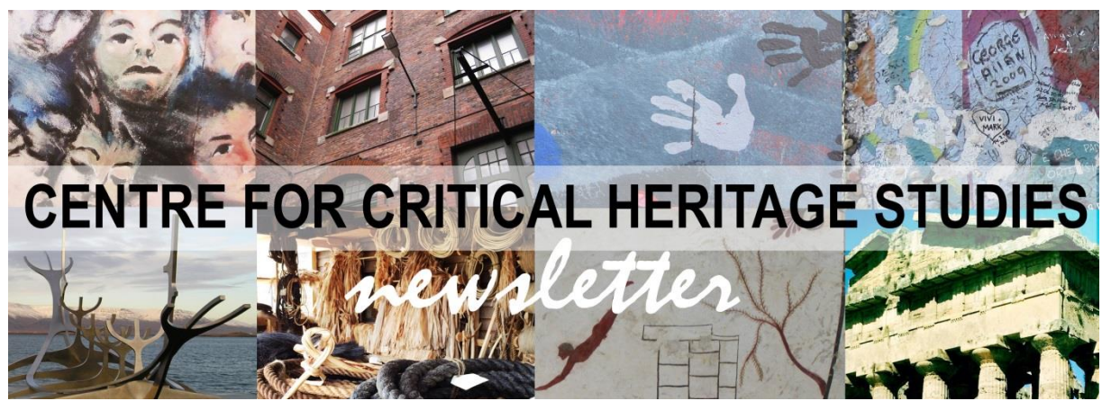
For further information and updates, visit our homepage at http://www.criticalheritagestudies.gu.se