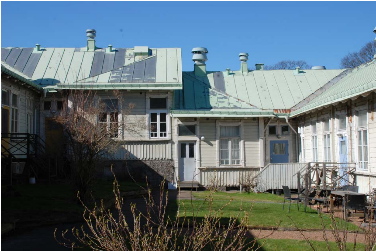
Photo of Konstpidemin

The project is a collaboration between Konstpidemin, Centre for Critical Heritage Studies (Heritage Academy & Heritage and Wellbeing), the Medical History Museum, Folkuniversitetet and the association Spotcity. The opening of the exhibition is set to 2021.