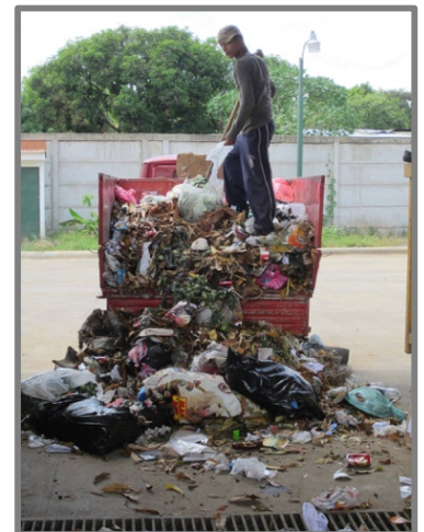
Waste cooperative Managua

Researchers in the two projects collaborate in offering a critical inter- and transdisciplinary perspective on waste governance, organizing resilience against climate and environmental change involving cooperatives, associations, community-based organizations, public-private partnerships, networks and organizations working with waste related issues.