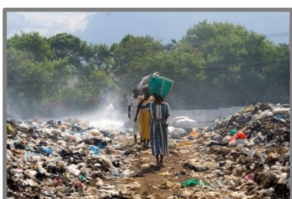
Informal waste workers, Kisumu

“Recycling Networks” addresses the following questions: