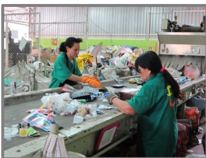
Waste cooperative, Ribeirão Pires