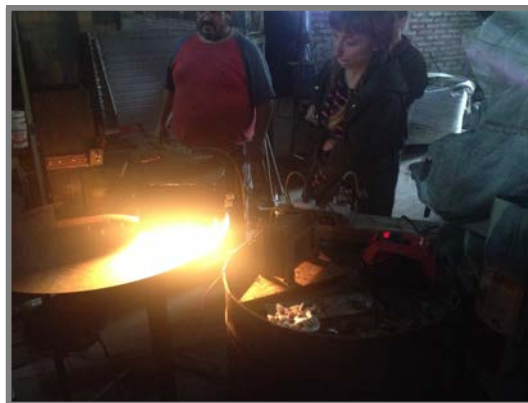
Grassroots technologies for recycling, Buenos Aires

Year 1: Multi-case studies of waste picker organizations in Buenos Aires, Dar es Salaam, Kisumu, Managua and São Paulo: a) Mapping grassroots innovations by waste picker organizations with a survey, followed by b) in-depth studies of innovations through interviews, observations and interactive workshops in each city/country. Year 2: a) Reports from each city/country are discussed in a workshop/seminar in Kisumu by scholars and waste picker organizations. b) A common report is published and scientific publications written. c) A study of global and regional waste picker networks is conducted through interviews and document analysis. d) Workshops in each city/country to diffuse results and prompt interventions in waste governance through waste picker organizations/ networks. Year 3: a) In-depth case study in Kisumu b) International research and waste pickers conference c) production and diffusion of final report and scientific publications.