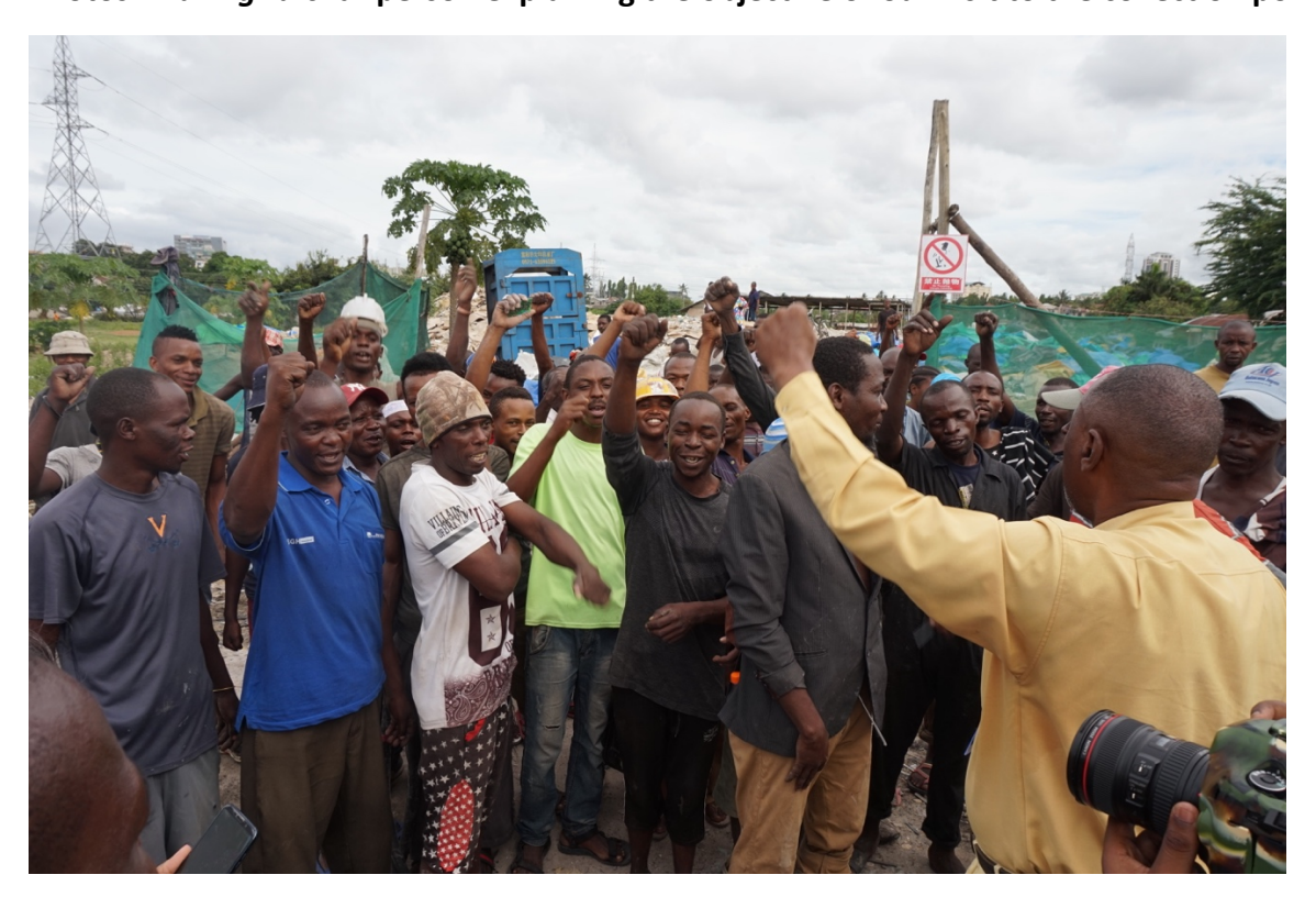
Visit to Jangwani Photos: Mazingira chairperson explaining the objective of our visit to the collection point