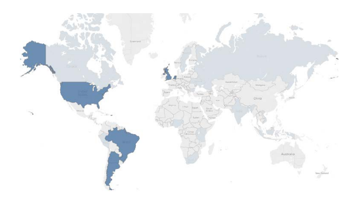
FIGURE 6, LOYALTY TO LAWS